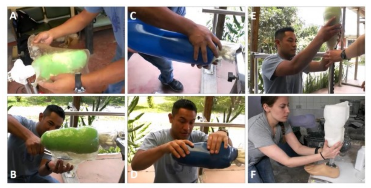
Figure 4. Fabrication method. A – Drape-molding thermoplastic, B – Trimming excess material (can be re-used), C – Applying global compression, D – Applying localized compression, E – Adjusting alignment of proximal socket-pylon adapter, F – Adjusting overall alignment.

The fitting process makes the RightFit prosthesis truly unique and revolutionary.